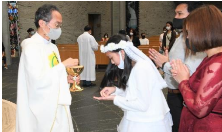
Reception of the Body of Christ