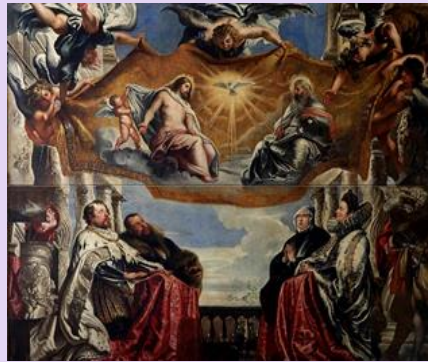
The Gonzaga Family Worshipping the Holy Trinity by Peter Paul Rubens (1577-1640)