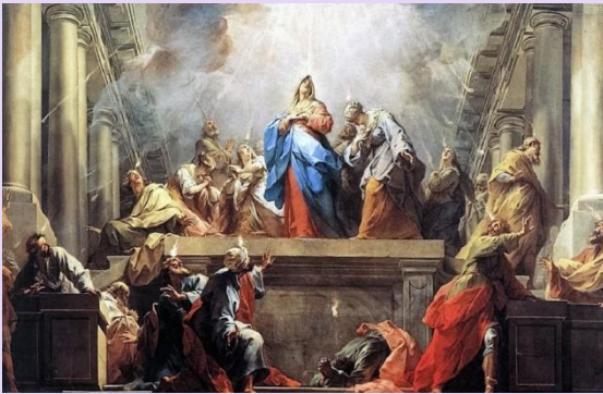
Pentecost by Jean II Restout (1692-1768)