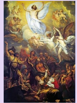
The Ascension by Benjamin West (1738-1820)

The month of May immediately brings back fond early memories of schoolyard banner-spectacled parades for our Blessed Mother lead by the nuns singing, 'Hail Queen of Heaven'. This year, drawing back the curtain, we can see that May is truly the month of Mary and yet we also have other significant feast days and celebrations making May a wonderful month for reflection, prayer and inspiration. In particular we have the Ascension of the Lord, Pentecost Sunday, The Most Holy Trinity, and the Visitation of the Blessed Virgin Mary. Let us also remember St. Joseph the Worker, (May 1st) in this 'Year of St. Joseph.